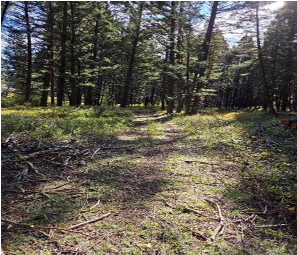
Figure 5. Photo of trail cleared into the IRA using a side-by-side from private land.