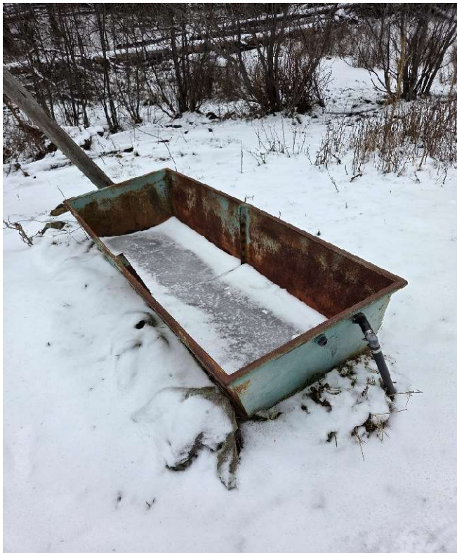
Existing Tanks are in Good Condition. 46.53340 -112.20352