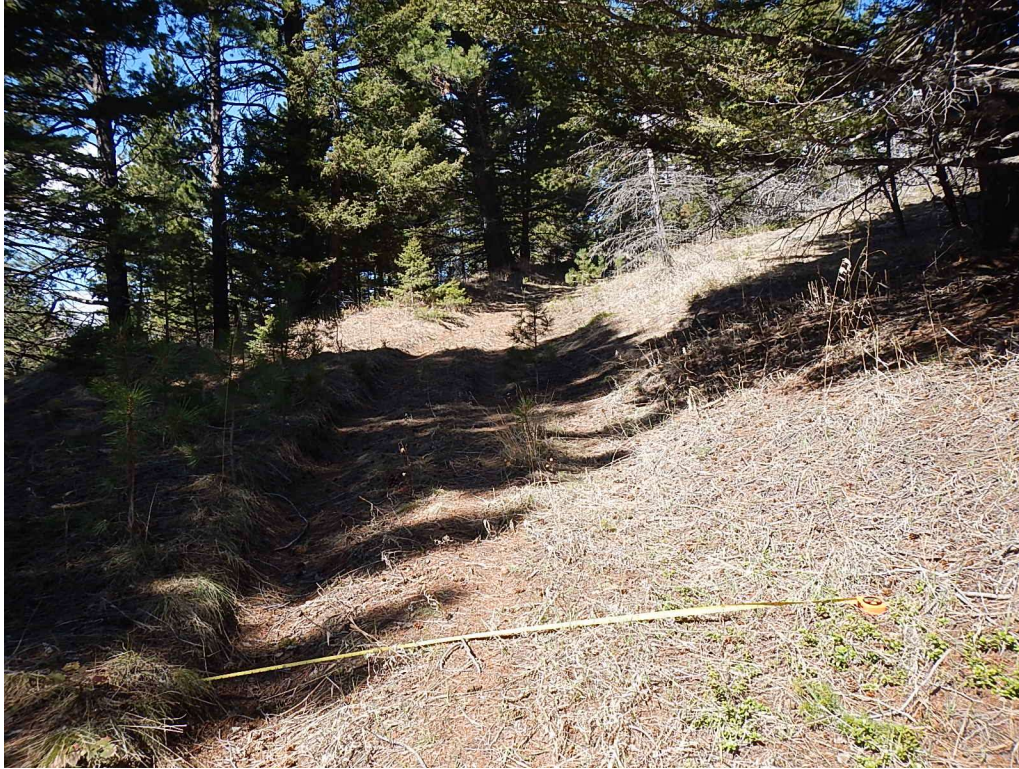
WAYPOINT 004 (11) West. Steep, old, tilting roadbed 7 ½ feet with 12 inch trail.