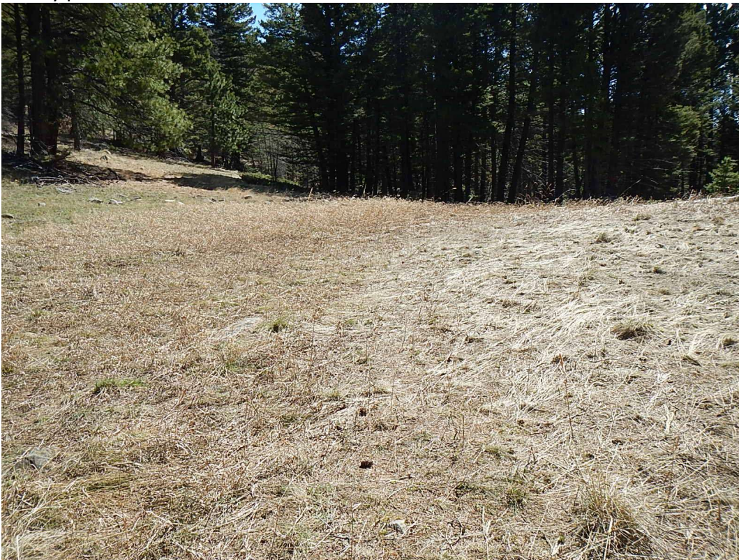
(30) looking back across park on Travis-Colorado-Nelson Divide.