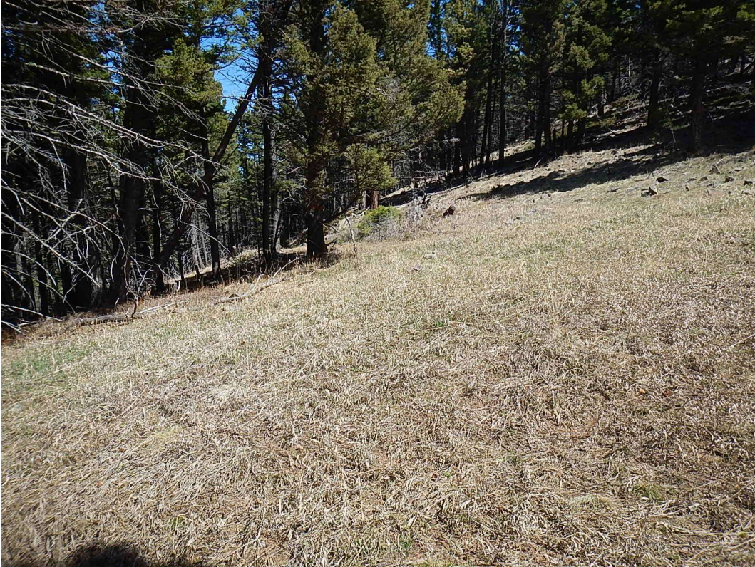
WAYPOINT 11 (29) N aspect End of 4000-NS01 and Junction with 4000-001. No road or trail. Grassy park. Travis-Colorado-Nelson Divide.