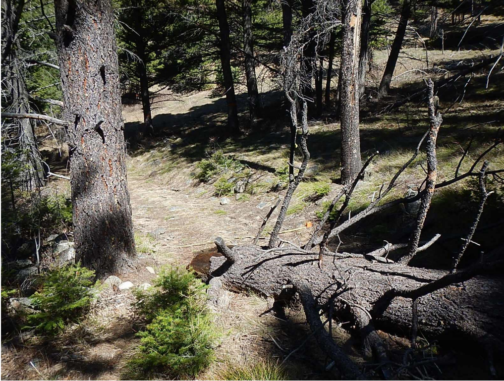
WAYPOINT 007 (17) NW 7' bed. Downfall and seedlings 90 steps further is Junction with 4000-NS04