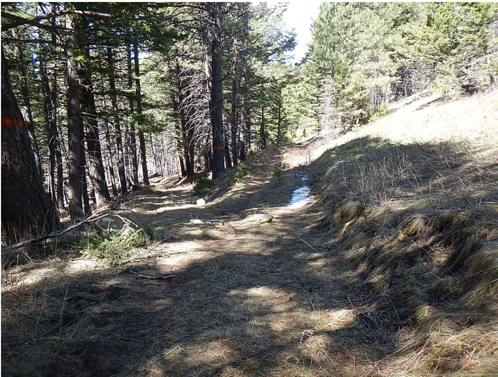
Wpt 007 (18) About 225 feet west is Junction of NS04