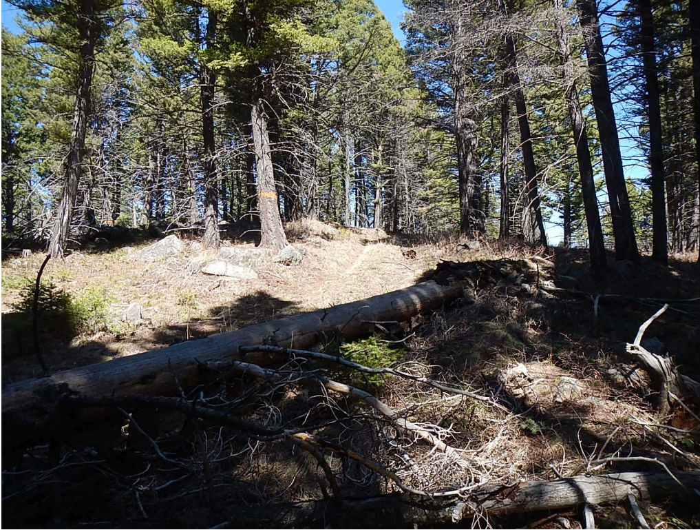
WAYPOINT 010 (26) N Downfall. Marked orange leaf trees.