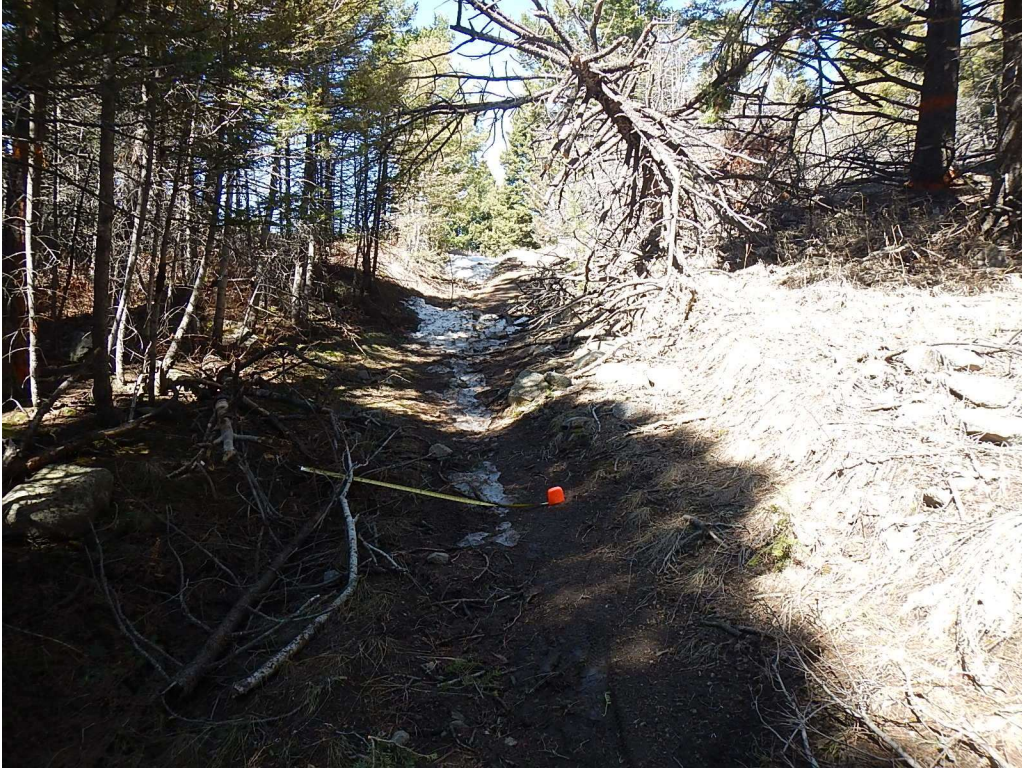
WAYPOINT 006 West 4' trail. Old erosion has stabilized.