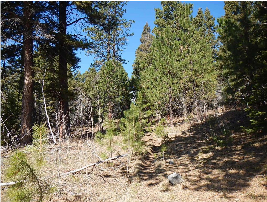
110 feet further west is Junction with NS12 (left off photo). Ponderosa seedlings in trail.