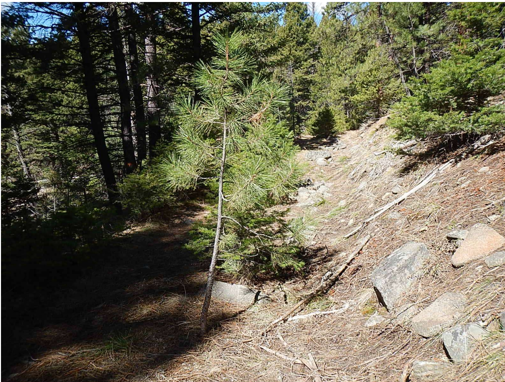
WAYPOINT 008 (20) West Rocks Doug fir and Ponderosa