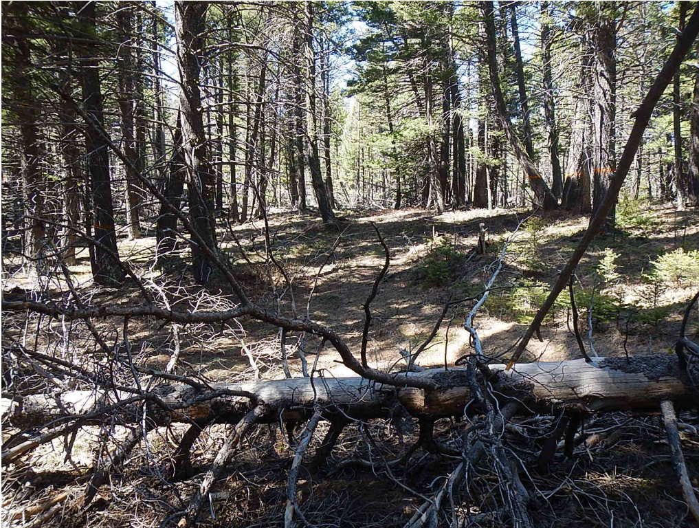
(27) Junction with NS11