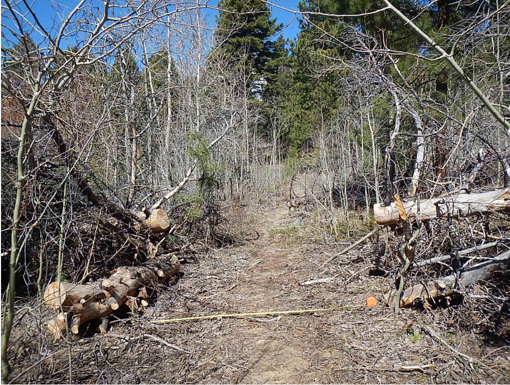
WAYPOINT 005 (13) West Trail has been cleared.