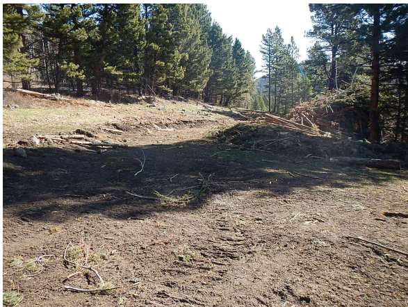
Ponderosa pine growing in road (above). Pink X's with pink flagging mark the spot where the new "Feature" road was allowed by Forest Service contract to extend into the IRA but it turned northeast at the boundary (photo to left).