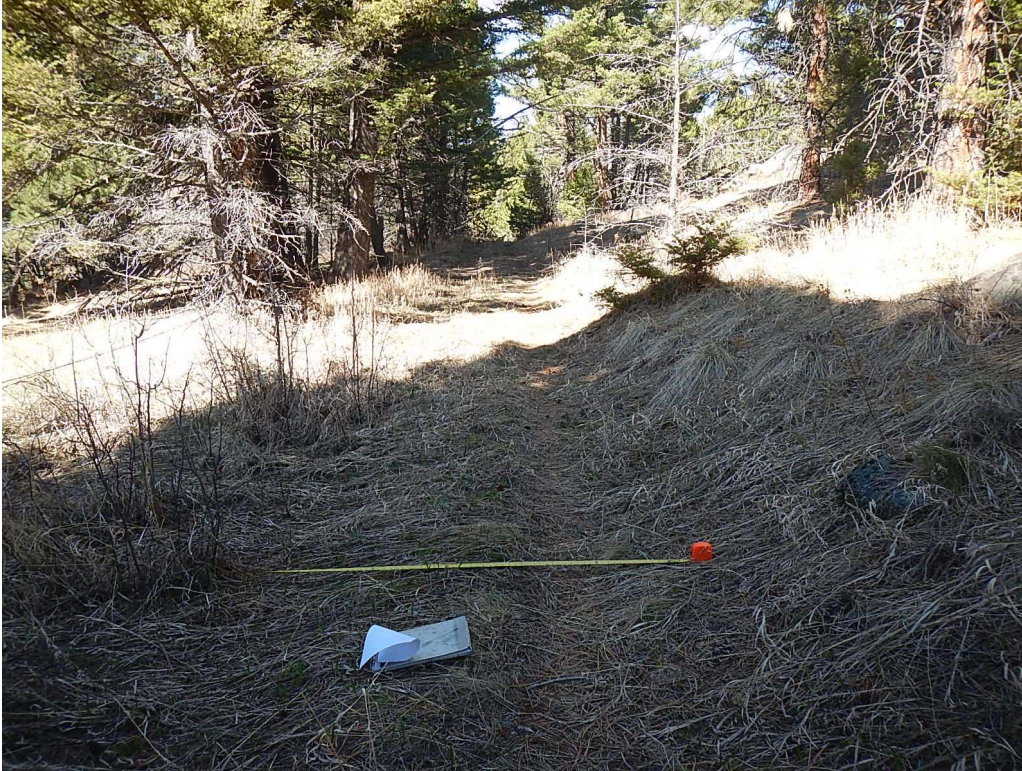
WAYPOINT 002 (8) West. No bare ground. 6'3" road bed. Chokecherries invading road.