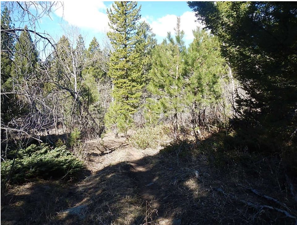
180° looking back Eucalyptus, horizontal juniper, conifers growing in trail