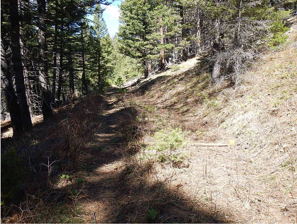
WAYPOINT 008 (19) Ponderosa in 7'8" bed