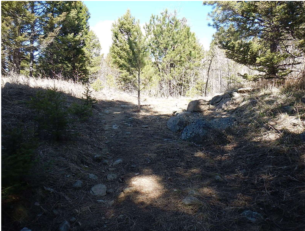
130 feet beyond Waypoint 004. Rocks and trees growing in road bed.