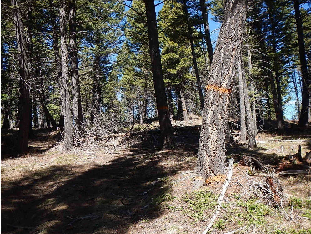
80 yards further trail curves to north. Marked leave tree. All others to be cut.