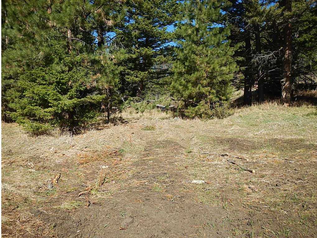
WAYPOINT 001 (1) Eastern edge of Lazyman IRA from new "Feature Road" (next photo)