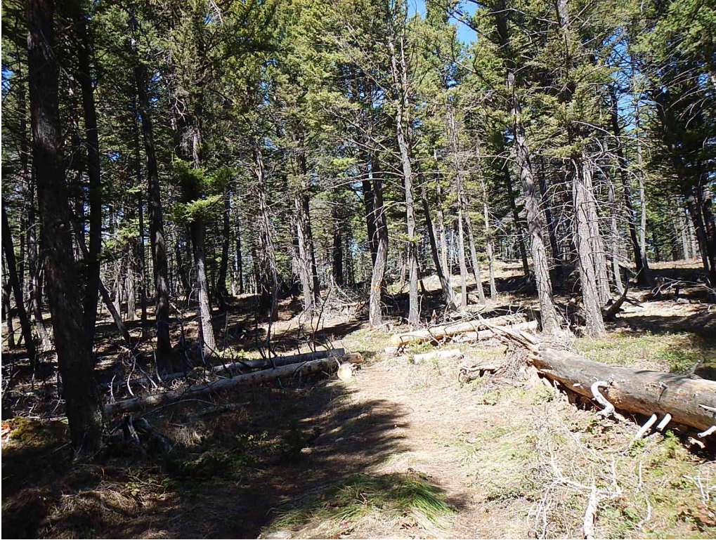
WAYPOINT 009 (23) NW 38 yards. Downfall has been cut out for hikers/horses.