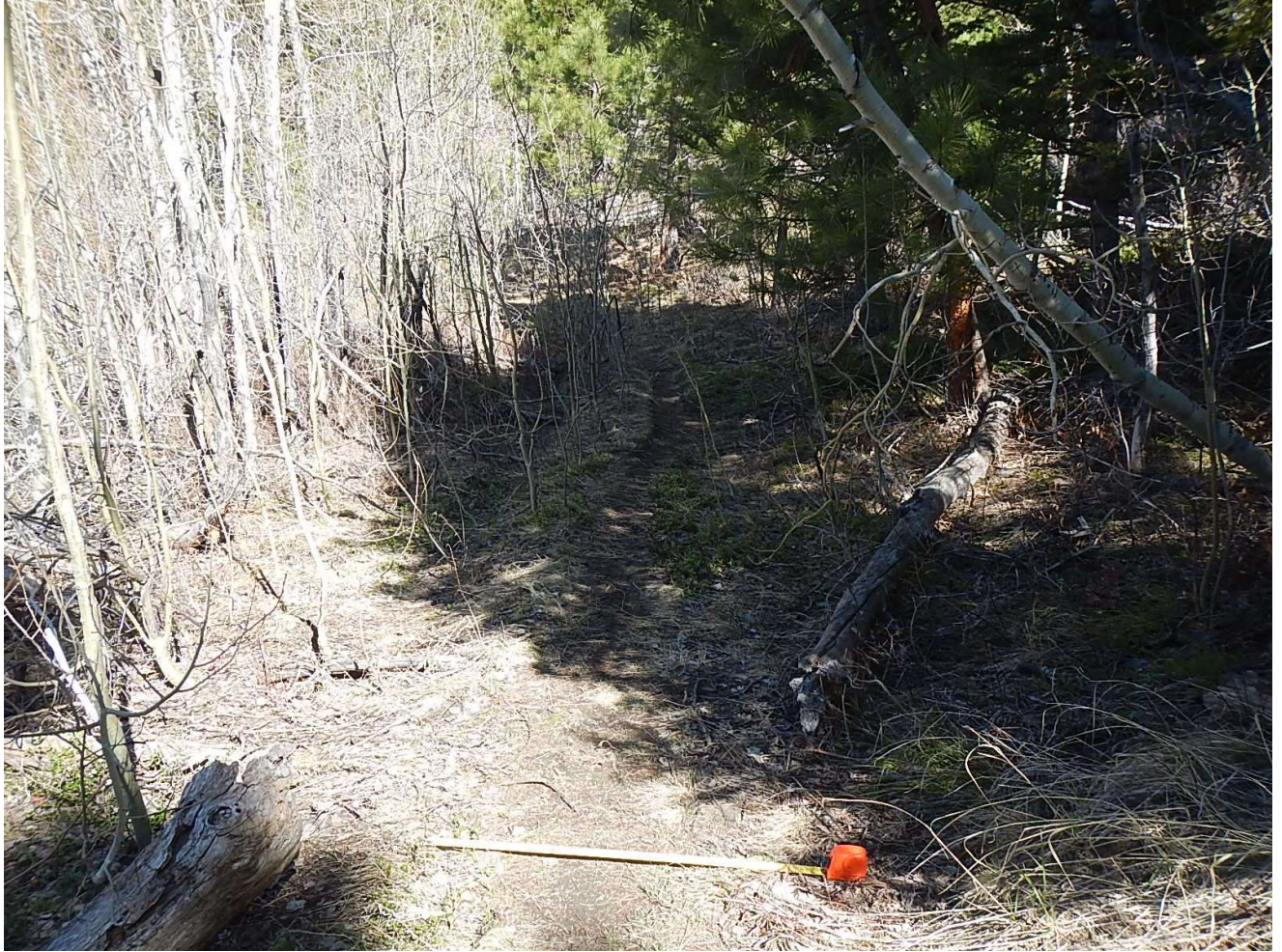
WAYPOINT 003 (10) NW Aspen in trail. 3' wide trail