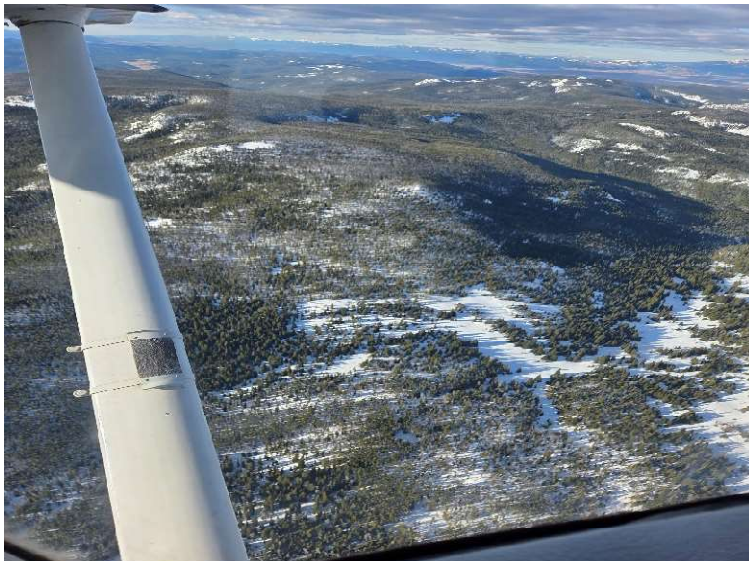
Gunsight Pass, view to the south.

We flew a portion of the Lazyman IRA beginning with Blackhall Meadows, continued north one mile to the recent placer mining area, then west over Black Mountain, down Moose Creek towards the Rimini Road and private land, then back east over Lazyman Pass, and into the West Fork of Colorado Gulch Creek.