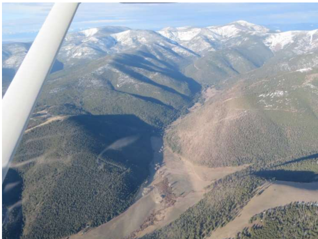
Looking west towards the Continental Divide and the Nevada Mountain IRA on March 29, 2026.