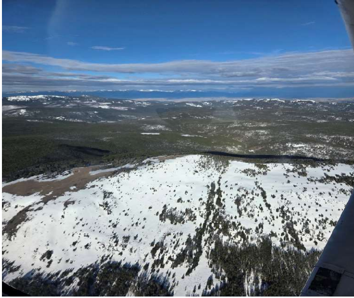
Bison Mountain, view to the west.