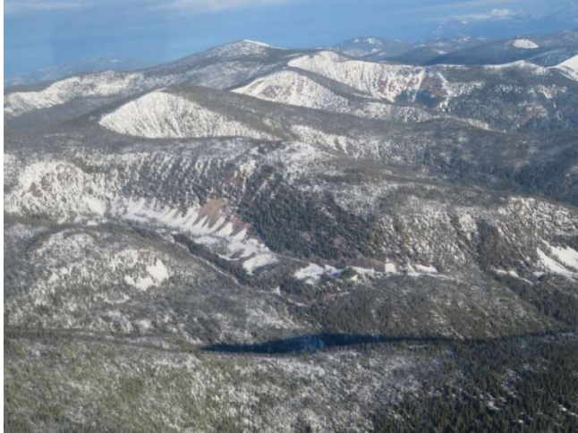
Nevada Mountain (background) and more of the the IRA (foreground).