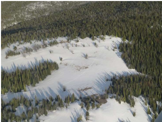
Snowmobile tracks documented within the Nevada Mountain IRA on March 29, 2026.