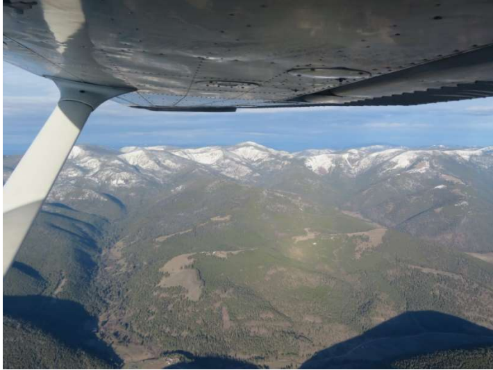
Panoramic view of the Continental Divide and the Nevada Mountain IRA looking west, March 29, 2026.

We then flew south to the Jericho Mountain IRA. There were no snowmobile tracks on the Divide north of the gate near Bullion Parks. Large areas were logged within the IRA along both sides of the CDNST. These areas were more visible since the last flight with receding snow.