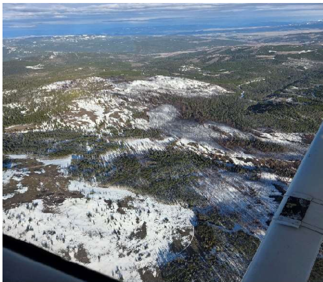
Jericho Mountain IRA, logging unit and the Jericho Mountain 2025 wildfire.

We then flew south to the Jericho Mountain IRA. There were no snowmobile tracks on the Divide north of the gate near Bullion Parks. Large areas were logged within the IRA along both sides of the CDNST. These areas were more visible since the last flight with receding snow.