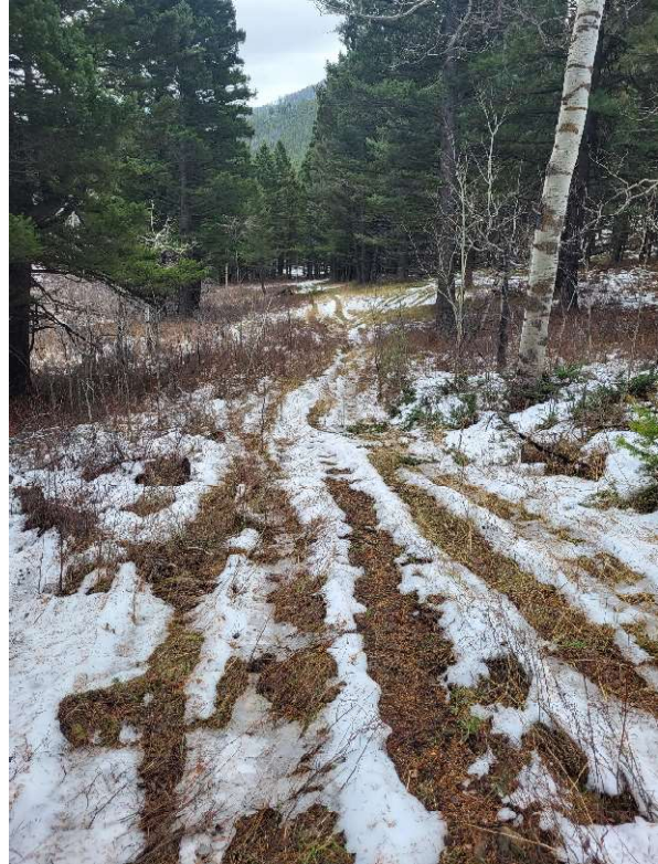
Illegal motorized use in Lazyman Inventoried Roadless Area.